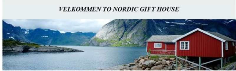
VELKOMMEN TO NORDIC GIFT HOUSE

Your premier source for Scandinavian themed gift items featuring Jewelry, Runic/Viking, Knitwear, Ozone Socks, Home Decor, Kitchen items, Swedish dishcloths, and Heritage items. We invite you to visit our website, subscribe to our newsletter and enjoy this special offer.