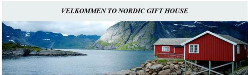
VELKOMMEN TO NORDIC GIFT HOUSE

Got Stamps? Tubfrim Is Still Accepting $ Please leave a 1/4 " around cut stamps. We are continuing to support Tubfrim , a Norwegian-owned charity that resells cancelled stamps to benefit Norwegian children with health and other physical disabilities. Every little bit helps. The effort has continued since 1928 and will hopefully continue with our help as long as there is need. Bring them to the next meeting & any of our officers will take it from there.