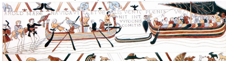
Bayeux Tapestry 3: Harold crosses the Channel and is made prisoner by Guy Count of Ponthieu