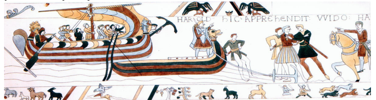
Bayeux Tapestry 4: Harold crosses the Channel and is made prisoner by Guy Count of Ponthieu