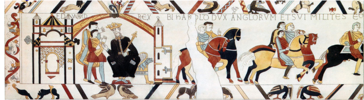
Bayeux Tapestry 1: Harold attends the court of King Edward the Confessor before his journey to Normandy

To the Norman Invasion of Britain index Annexe for the Bayeux Tapestry: https://www.britishbattles.com/norman-conquest