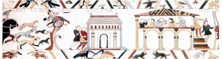
Bayeux Tapestry 2: Harold attends the court of King Edward the Confessor before his journey to Normandy