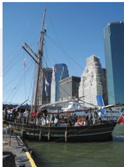
When the crown prince meets descendants of Norwegian immigrants here in the United States — many now several generations removed from their Norwegian ancestors — what makes the greatest impression on him about the way they preserve their identity within today's Norwegian-American community? about the way they preserve their identity within today's Norwegian-American community?

Remember you can expand the size by selecting the picture.